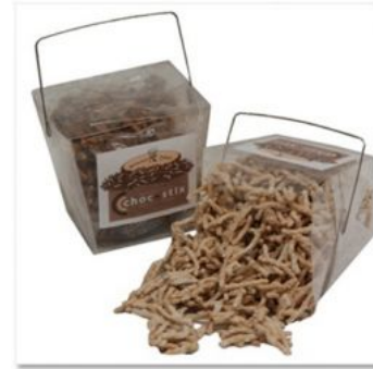
Chocolate Chinese Stix